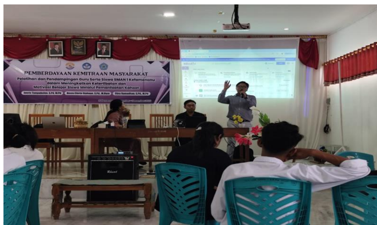
Picture 1. Team Presents Game-Based Learning Materials

This community service activity was held to socialize the concept and application of game-based learning to teachers and students, as part of the digital transformation of education. The socialization was conducted through various interactive activities that involved introducing the benefits and challenges of implementing games in the learning process, as well as their impact on student learning effectiveness. This activity was attended by 45 teachers and 45 students as representatives of SMAN 1 Kefamenanu.